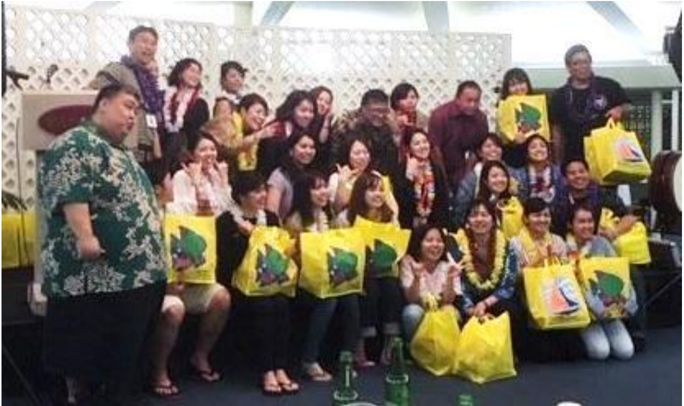
About 30 students and staff traveled from Okinawa to Hawaii to attend the 2019 Loochoo Identity Summit. They were from Hands On, graduates of Yaeyama High School, and the Okinawa Christian University. Pictured are the students, staff, and members of Ukwanshi Kabudan.

It is with great sadness and reluctance that I submit this letter of resignation as executive director. I am unable to continue in this position full-time and work to the best of my ability with the challenges I am facing. After several months' effort, I think it is better for me and for the organization to step down rather than later considering the year ahead and for 2020.